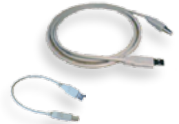
2m and 0.5m USB cables