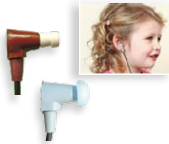
OAE probes 288-I 1 x TE 288-II 1 x DP, 1 x TE