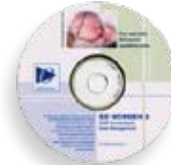
EZ•Screen PC software